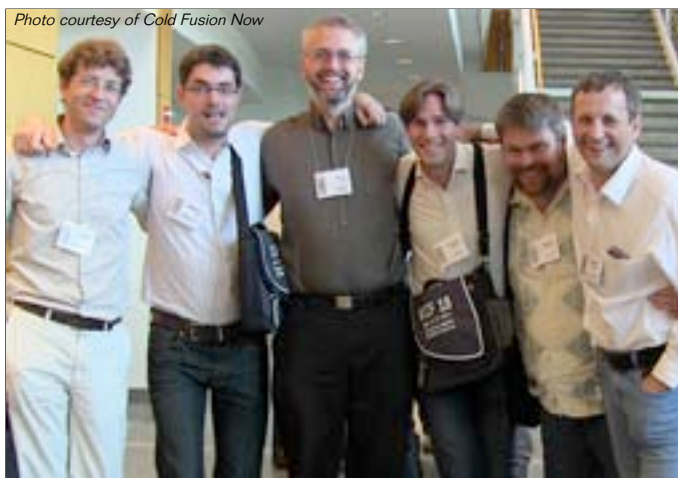
Members of the New Fire Generation.